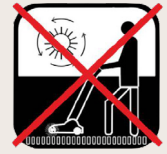
Brush vacuum cleaning