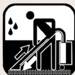
Spray extraction straight