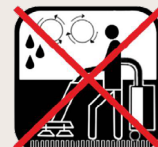
Spray extraction rotating